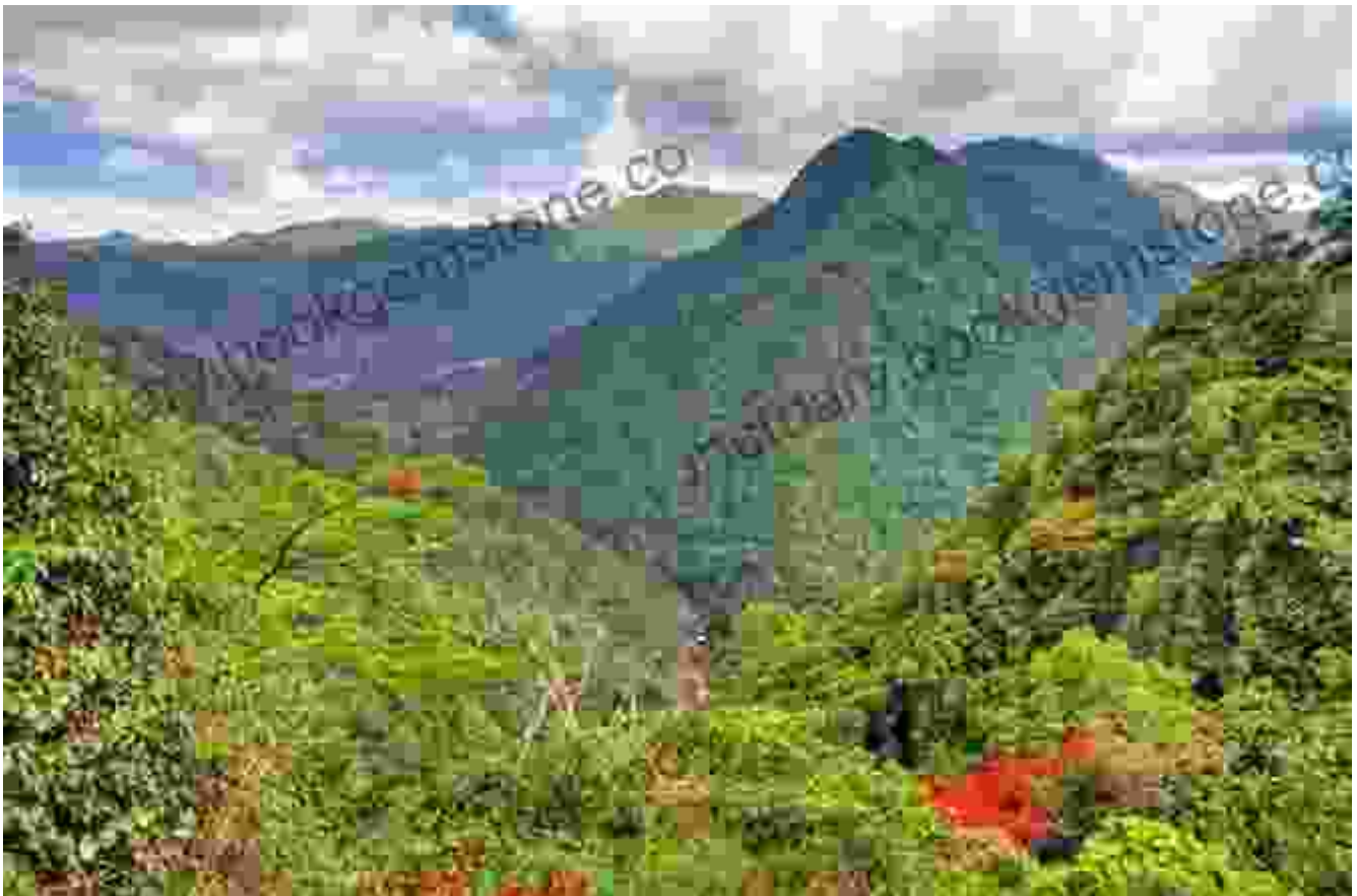
San Juan Puerto Rico & Environs (Travel Adventures)