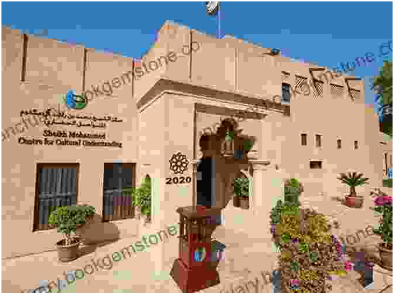
Sheikh Mohammed Centre for Cultural Understanding