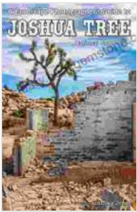
Image 3: [Alt text: A landscape photo of Joshua Tree National Park with a desert sunset.]

Image 2: [Alt text: A landscape photo of Joshua Tree National Park with a group of hikers walking through a canyon.]