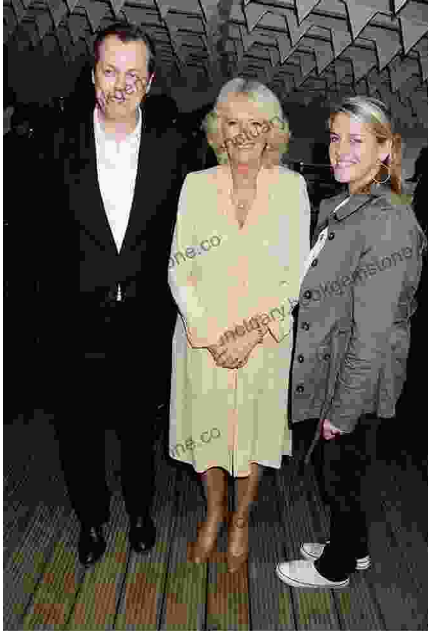
Queen Consort Camilla, Duchess of Cornwall.