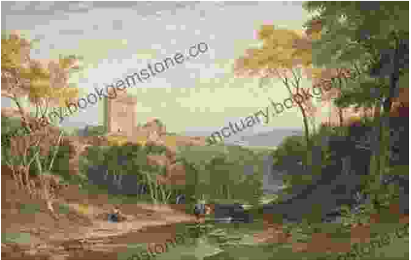
The Trossachs, Scotland